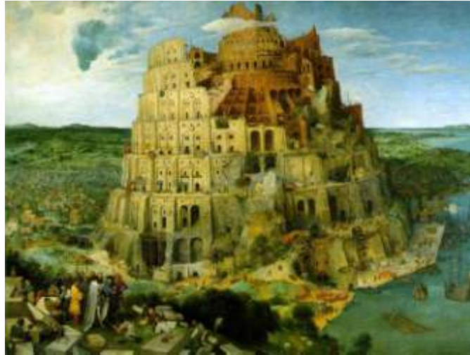
Pieter Breughel the Elder The Tower of Babel 1563

Agnew's works draw us in as viewers. They are finely crafted, beautifully detailed, with a rich pictorial sensibility. His drawing of foliage, rocks or architecture is highly skilled and the process of etching into the panel combined with oil painting develops a multi-layered image, refined in its execution and visually enticing. The process of their making is a vital component to their success as artworks.